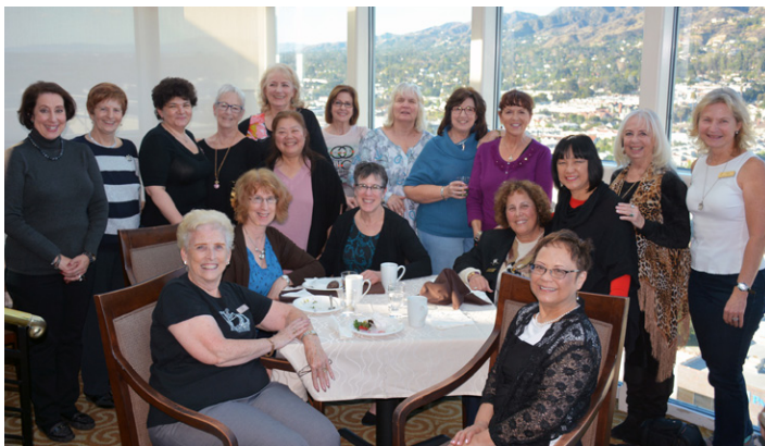
NSD Queens, past, present and future enjoyed the laid back hospitality from the 19th floor lounge.

The weekend festivities started with a wonderful hospitality event on the 19th floor, with views overlooking the city on such a glorious southern California day. What a spectacular way to meet my fellow queens and try to remember the names and faces! So fitting for the wonderful group of people who gathered for this special occasion!